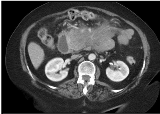
Figure 1. Mass originating from the uncinate process of the pancreas and showing vascular invasion, extension into the jejunum and duodenum, causing stenosis of superior mesenteric vein.

lymphoma. Flow cytometry was inconclusive. A bone marrow biopsy was performed in order to identify the clinical prognosis and chemotherapy regimen. Bone marrow biopsy showed normocellular pattern. In order to evaluate the invasion pattern, an abdominal magnetic resonance imaging was performed which revealed a soft tissue mass which extended from the uncinate process of the pancreas, to the root of the mesentery, consistent with lymphoma (Figure 2A).