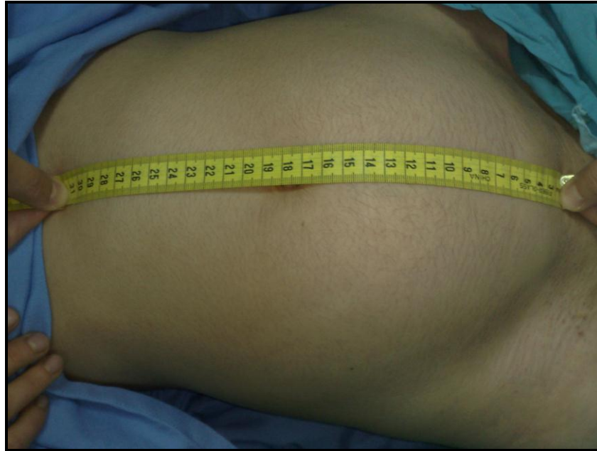
Figure 1. Right ovarian cyst filling the whole abdominal cavity.

abdominal cavity. We extirpated the cyst capsule as in open laparotomy (Figures 4-5).