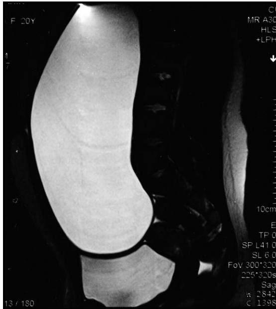
Figure 2. Magnetic resonance image of the cyst in sagittal section.