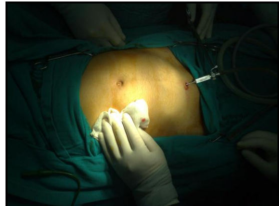
Figure 3. Insertion site of the Verres Needle connected to the aspirating device.

Pin-point coagulation was sufficient for haemostasis. The edges of the ovary tissue were approximated by four simple sutures and the right ovary was placed into its original site. The patient was discharged on the second day after the operation without any complications. The pathological diagnosis of mucinous cystadenoma confirmed the benign nature of the cyst.