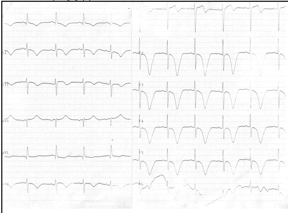
Figure 1. ECG from the patient shows sinus rhythm on i.v. famotidine 20 mg bid, (QTc=624 ms).

coronary arteries. Lee et al. (4) reported famotidine induced long QT syndrome in two cases, however in these patients, there was multiple co-morbidities such as ischemic heart disease, congestive heart failure, renal failure, amiodarone administration and elderly patient which are listed in risk factor for the long QT syndrome (1,4). Female gender was the only risk factor for the long QT syndrome in our patient. Also, we scored the famotidine-induced long QT adverse effect according to adverse drug probability scale (9), the result was reliable with probable category.