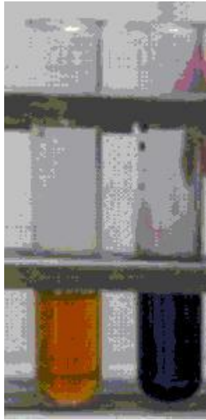
Figure 2. Thormahlen's test determining the abnormal presence of melanin in the urine. It has been seen in the picture that after test urine takes a deep blue color (on left).