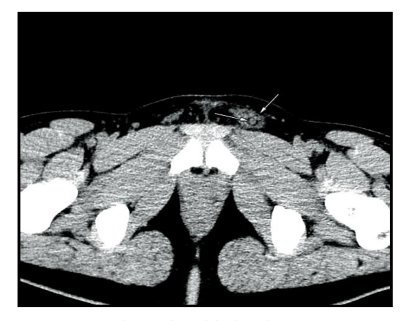
\label{eq:Figure 2.} \textbf{Figure 2.} \ \textbf{Arrows showing the nodular hiperdansities in a spermatic vein}