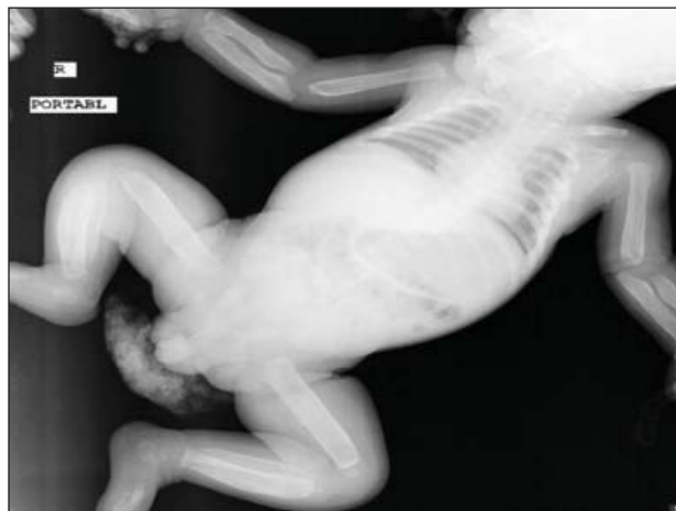
Figure 1. Diffuse cortical thickening (hyperostosis) and periosteal reaction involving the long bones (femur, tibia, and humerus) and clavicles.

the duration of PGE1 infusion, our findings suggested prostaglandin osteopathy. It was estimated that cortical hyperostosis developed after the cumulative dose of PGE1 of 5702 µg/kg.