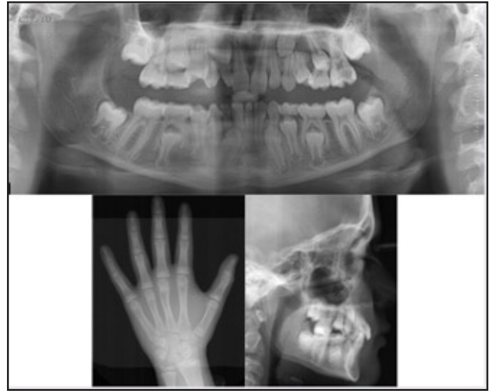
Figure 2. Panoramic radiograph , cephalometric radiograph and hand-wrist radiograph of case 1

Congenitally deficiency of mandibular lateral teeth and an additional tooth in the mandibular central tooth area is a very rare presentation. Our patient provides an example of both a very rare case of mandibular mesiodens and a case of hypo-hyperdontia (Figure 2). A follow-up visit to the orthodontic clinic 3 months later was scheduled to evaluate the direction of eruption of the ectopic teeth and the crossbite of tooth number 12 with mesiodens and bilateral tooth deficiency.