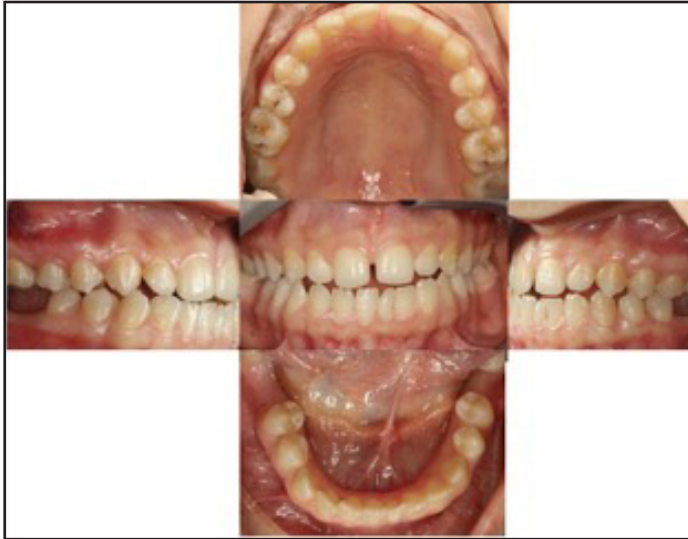
Figure 3. Intraoral photos of case 2

study on hypodontia in Sayada, Tunisia showed that congenitally deficient teeth are probably inherited as an autosomal dominant trait [12]. In the first case, the patient's mother was also found to have a similar deficiency of teeth.