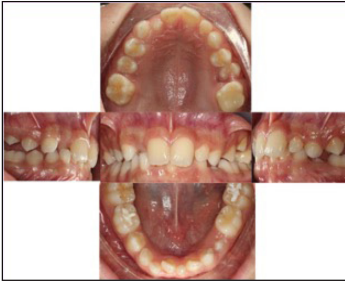
Figure 1. Intraoral photos of case 1