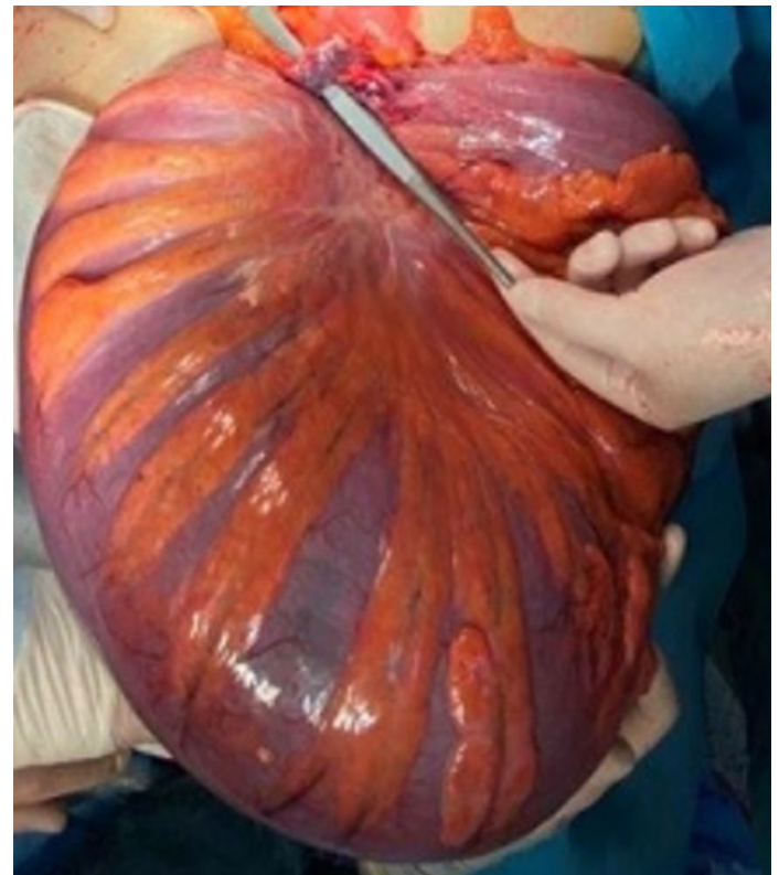
Figure 3. Image of Sigmoid Colon in Laparotomy Due to Volvulus

When the American Society of Anesthesiologists (ASA) scores of the patients in our study were examined; 4 (9%) patients were classified as ASA-2, 21 (47.7%) patients were classified as ASA-3, and 19 (43.18%) patients were classified as ASA-4. Mortality was higher in the group with ASA 4. (p=0.002) (Table 4). When patients who developed hospital mortality and those who did not develop hospital mortality were compared, WBC, Hb, neutrophil, plt, CRP, albumin, BUN, creatinine, ALT, AST, pH, lactate, bicarbonate values between the groups. No significant difference was detected between. When the groups with and without colonoscopy were compared, pH and bicarbonate values were statistically significantly higher in the group with preoperative colonoscopy (pH 7.4 vs. 7.36 p=0.021, bicarbonate 24.5 vs. 22.41 p=0.003). No significant difference between these two groups was detected in other laboratory parameters (WBC, Hb, neutrophil, plt, CRP, albumin, BUN, creatinine, ALT, AST, lactate) (Table 5).