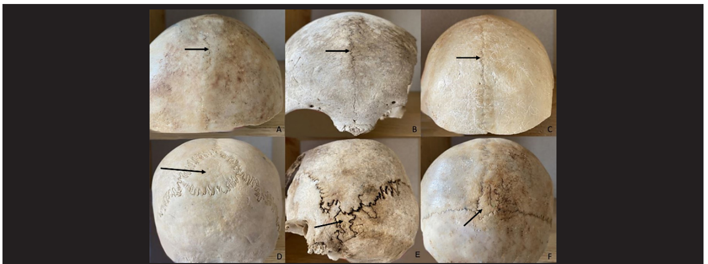
Figure 3. Wormian bones and Inca bones accompany the metopic suture skull. A, B, C: Front view of the cranium, D (Inca bone), E (Asterion), F (Bregma).