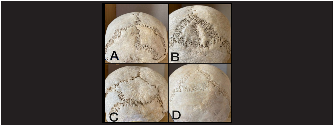
Figure 1. A. Incomplete lateral asymmetric, B. Complete symmetric bipartite, C. Incomplete asymmetric bipartite, D. Incomplete median