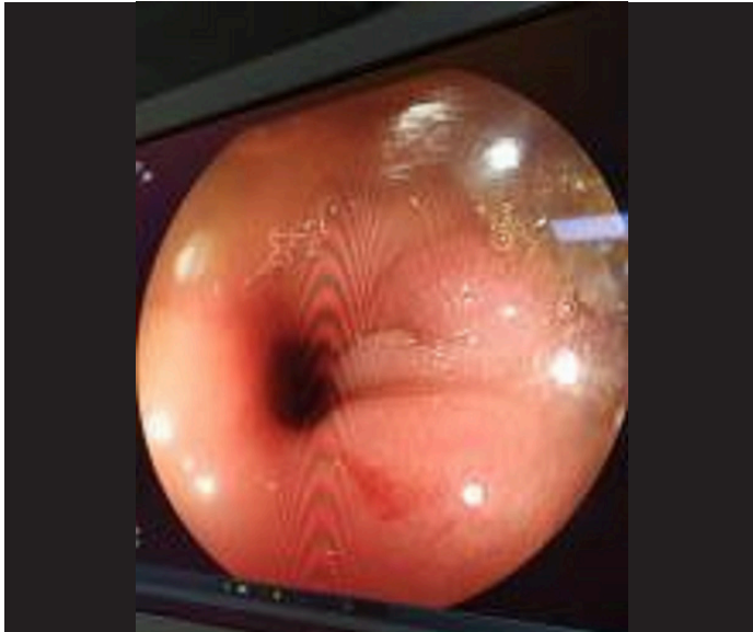
Figure 1. Before bougie dilatation

Keywords: Anastomotic stricture, colorectal surgery, bougie dilatation.