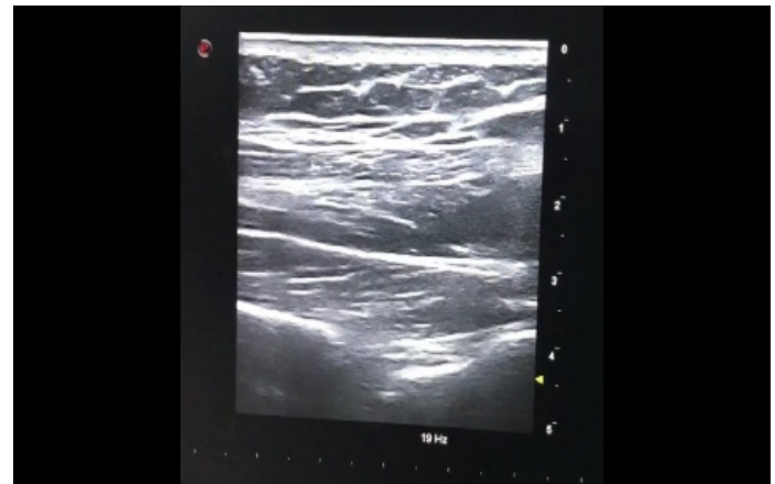
Video 1. Demonstration of real-time pulse radiofrequency needle insertion into the suprascapular nerve under ultrasound guidance