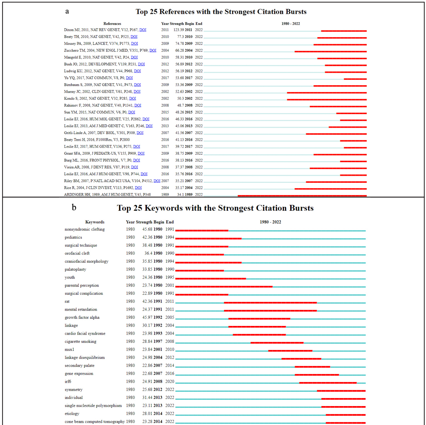
Figure 3. Citation burst analysis. a. Top 25 references with the strongest citation bursts. b. Top 25 keywords with the strongest citation bursts.