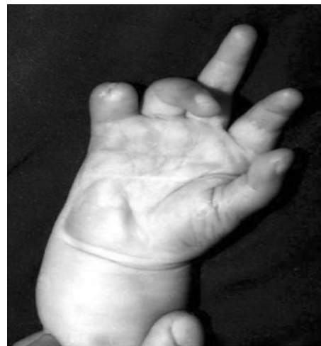
Figure 4. Note the amputated distal phalanx of the 5th finger in the right hand.

The diagnosis of non-accidental injury must be suspected when there is discordance between the history and physical findings. In this case, occurrence of the event could not be understood precisely because it was questionable whether a thorough history could be obtained from the parents. However, the present case seems a form of physical abuse in light of the physical findings of the patient. Anogenital impalement injuries occur rarely. In general, sexual abuse should be considered in the differential diagnosis (14,15).